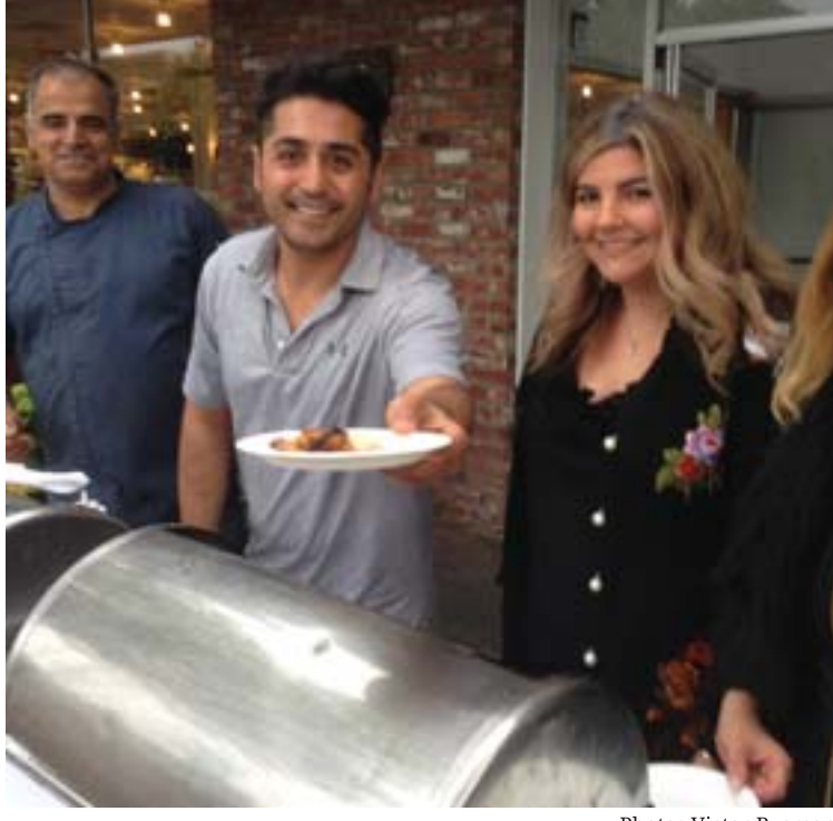
The friendly crew at Lavash, Lafayette's newest restaurant, serves up a portion of the restaurant's tasty Mediterranean fare.